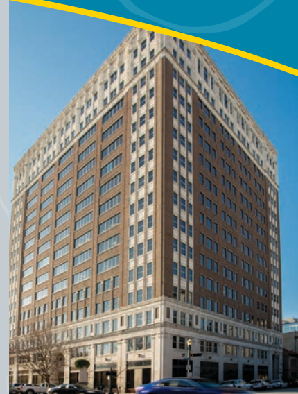
Anderson Clayton Building

$0 copay applies to all Harris County employees and their dependents (18 years and older) insured by the Harris County medical plan. This clinic does not treat workers' compensation injuries. Also, Kelsey-Seybold Clinic does not accept traditional Medicare when Medicare is primary.